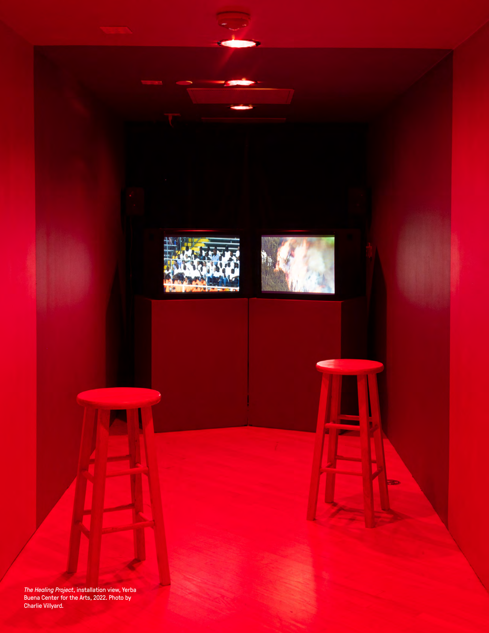
The Healing Project , installation view, Yerba Buena Center for the Arts, 2022.