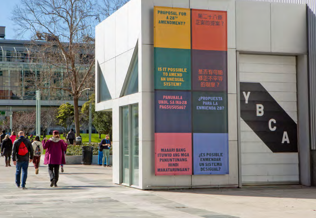
ABOVE Proposal for a 28th Amendment? Is It Possible to Amend an Unequal System? , installation view, Yerba Buena Center for the Arts, 2022-present.