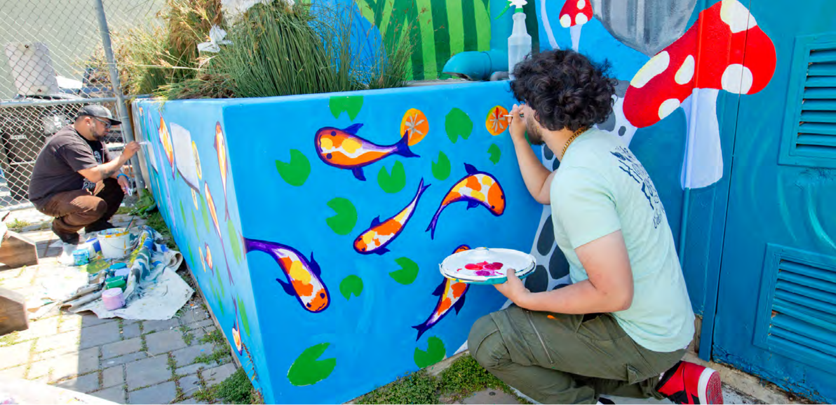
ABOVE Mural at Bessie Carmichael Middle School.

every community is represented. Through strategic partnerships, diverse programming, and accessible initiatives, we aim to break down barriers and ensure that the arts remain a dynamic and inclusive force that unites us all.