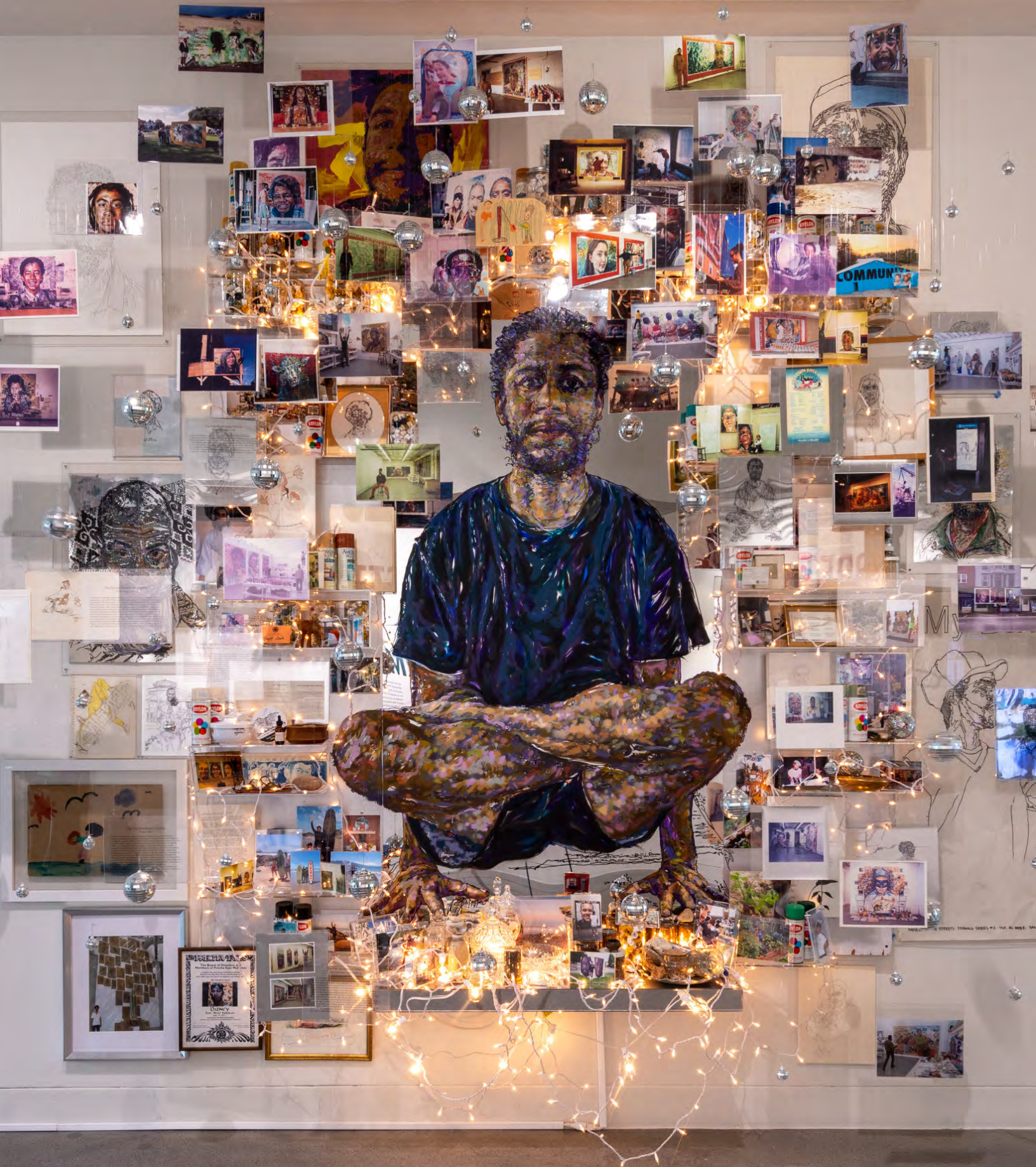
Brett Cook & Liz Lerman: Reflection & Action , installation view, 2022.