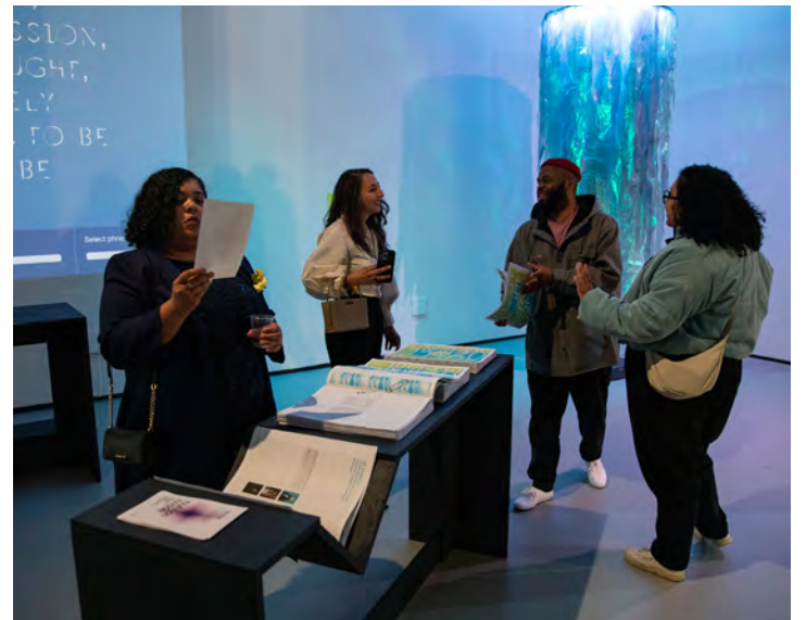
ABOVE The Healing Project , installation view, Yerba Buena Center for the Arts, 2022.