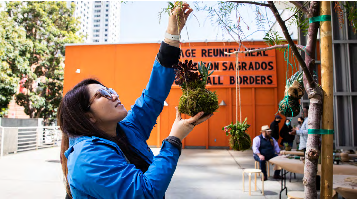
ABOVE YBCA 10 studio activation.