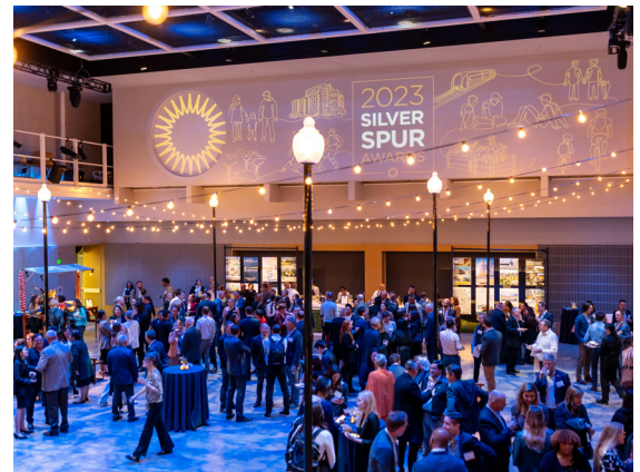
Standing reception for networking and cocktails