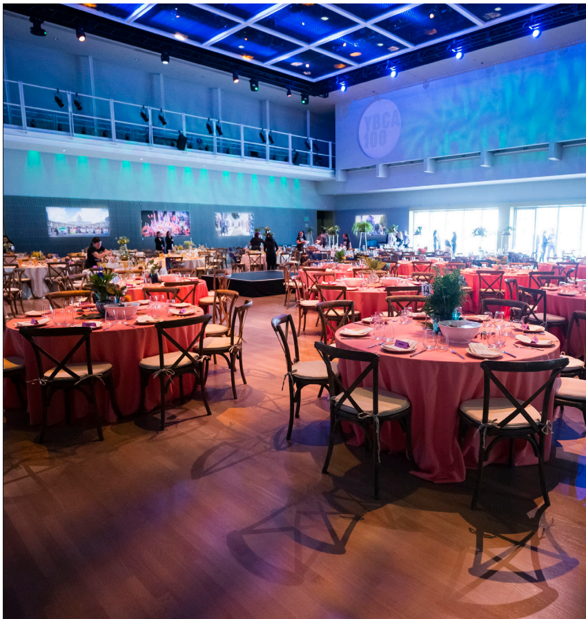
Table seating for dinner and gala