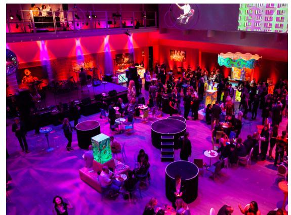
Multimedia performance event with live music